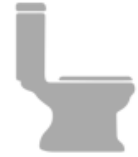
Sharing Toilets, Food, or Drinks