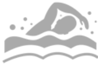
Air or Water